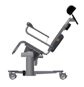
Recline position for the residents comfort and relaxation and allowing easy access for caregiver.