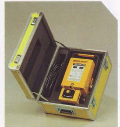
HF100+ units are supplied in a highly protective carrying case.