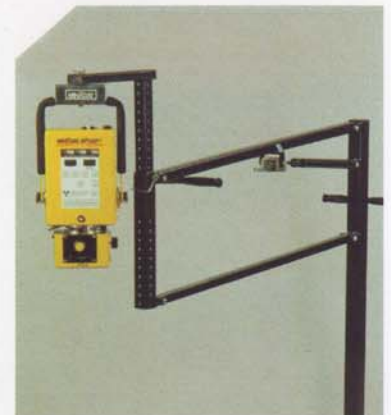
HF100+ mounted on the 300GS mobile stand for in-clinic imaging.

For more information about MinXray products, consult your local dealer.