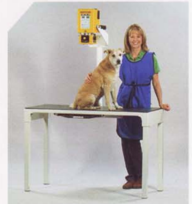
The XRT100+ X-ray table accommodates the HF100+ to make an ideal compact imaging system for small and mixed animal practices.